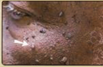
Fibroma on face