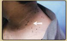
Fibroma on neck