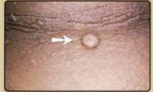
Flat Skin Tag